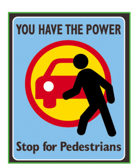
One of the signs used in the Missoula campaign.

The Police Department also contributes to the efforts by conducting Pedestrian Safety Operations, or "stings," with great media coverage. Modeled after a program started in Redmond, Washington , one officer in plain clothes plays the role of a pedestrian, stepping off of the curb once the driver has reached a distance from the crosswalk which gives them plenty of time to stop. If the driver does not stop, the officers in motorcycles then pull them over to issues tickets. The typical fine was $140, and the board spoke with Judges asking them to not be lenient, in order to send the message that the law was serious.