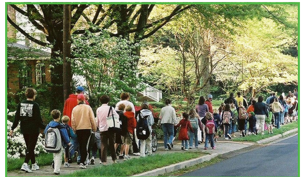
Nearly 200 students and parents participated in this monthly walk to Sherwood Forest Elementary School on a Physical Friday.

While the streets immediately around the school have sidewalks, many other streets in the neighborhood do not. Many children would need to use these streets to walk to school, and parents are concerned about their own and their children's safety. Kirklees Road, one of the longest streets in the neighborhood, provides a critical connection for many walkers. Much of this street also borders a city park with a very popular walking trail that many residents enjoy. A sidewalk on Kirklees would not only make it safer for children to walk to school, it would provide a safe connector for residents to walk to the park.